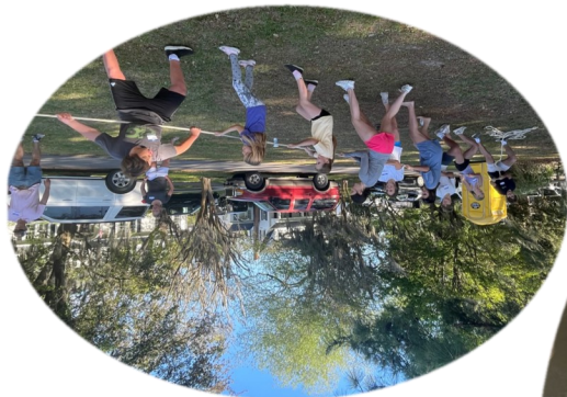
Church Family Picnic