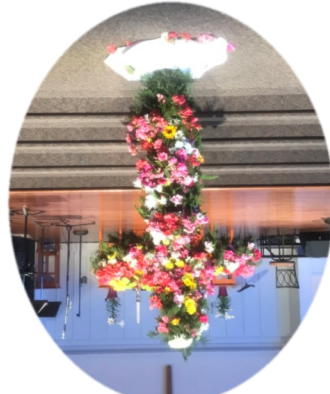
Easter Cross and Easter Egg Hunt

First Methodist Church Washington, Inc 304 West Second Street PO Box 715 Washington NC 27889 Phone: 252-946-3311 Email: admin@fmcwashington.com WebPage: www.fmcwashington.com Return Services Requested